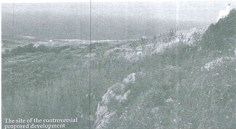
The site of the controversial proposed development

The application – to develop six apartments over three storeys, a pool and an additional floor for parking – is objected to unanimously by Zebbuġ Local Council. Environmental NGOs Din l-Art Helewa and Flimkien għal Ambient Alijar have also filed their objections to the proposed development.